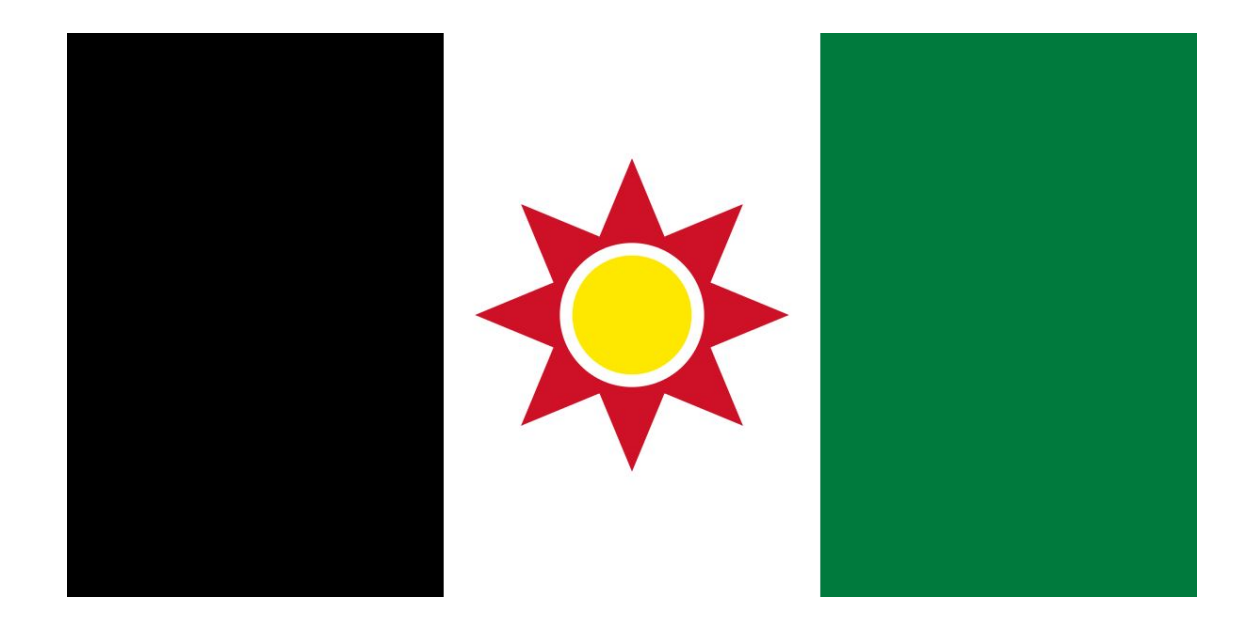
Figure 4.1 The Iraqi Republic flag with the Star of Ishtar (red) and Kurdish Sun (yellow)

even stated that "the Kurds, the Turkmen, the Assyrians, and Iraq's other minorities were all brothers in the republic."<sup>30</sup> An example of this was the newly redone Iraqi flag, that included the Star of Ishtar to represent the Assyrians, and the yellow sun to represent the Kurds. Overall, the state was heavily involved in multi-cultural production and protection. Groups were able to promote their cultures since it was considered part of Iraq's nation.